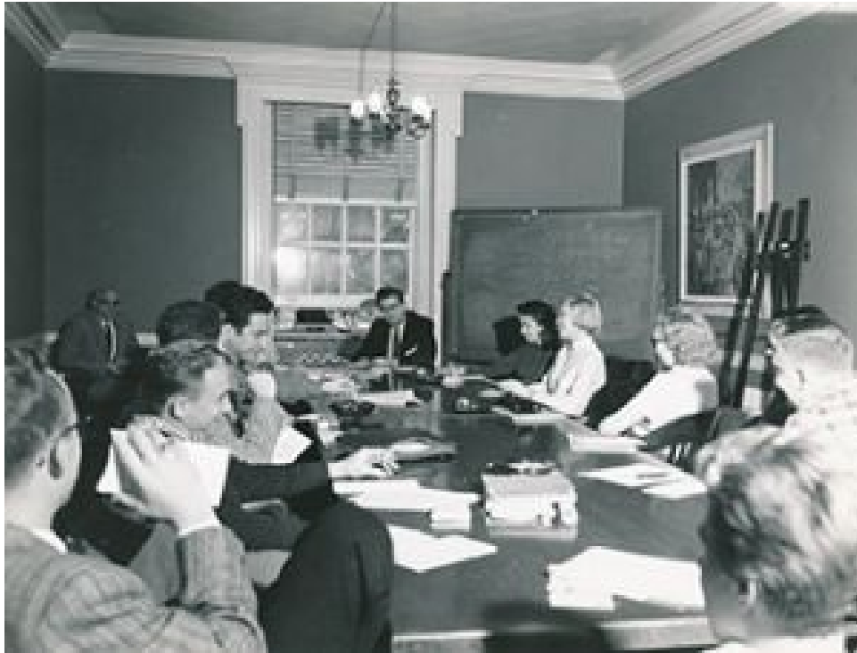
The early days of the Department of Advertising at the University of Illinois