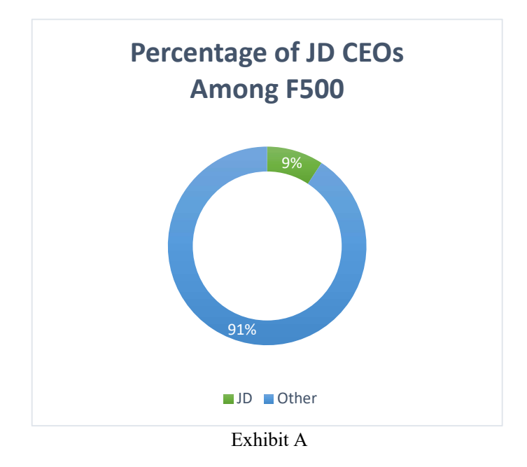
Exhibit A, JDs only made up a small fraction of Fortune 500 CEOs.<sup>16</sup> Looking deeper, Exhibit B shows that there were only 9 lawyer-CEOs among the Fortune 100, as per 2019.<sup>17</sup>