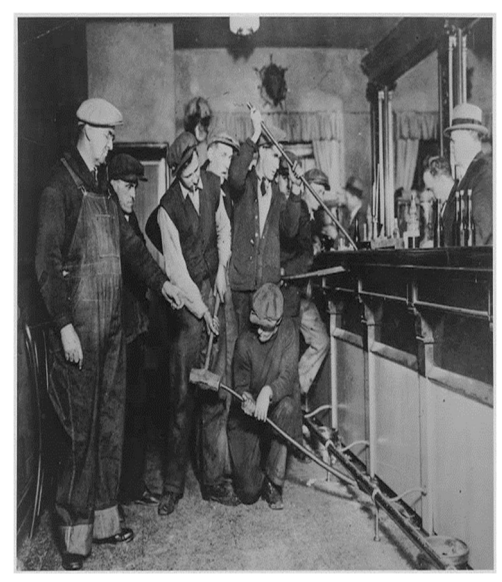
Prohibition agents destroying a bar