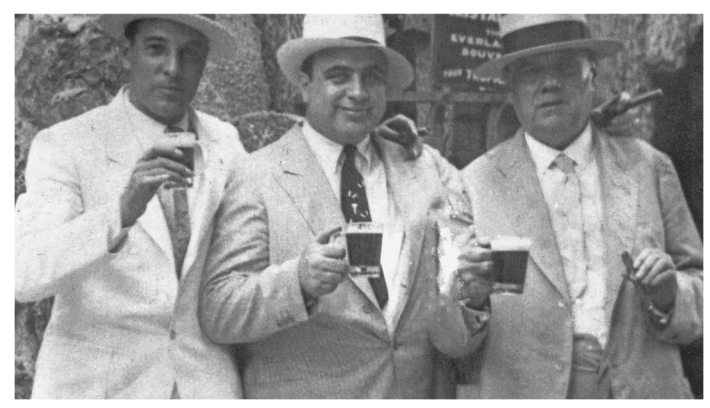
Pictured in middle: Al Capone (1899–1947)

Arguably, Prohibition can be described as a failure.<sup>79</sup> When Prohibition took effect, bootlegging and private distilling operations started occurring. Private, unlicensed barrooms—nicknamed "speakeasies" for how low you had to speak the password to gain entry so as not to be overheard by law enforcement—also became venues for alcohol consumers. While they did cater to female patrons, jazz musicians, and ballroom dancing, they also became the subjects of organized crime from syndicate figures like Al Capone.<sup>80</sup>