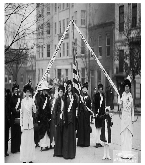
Women's Temperance Movement

2. Prohibition, Speakeasies, and Bootlegging