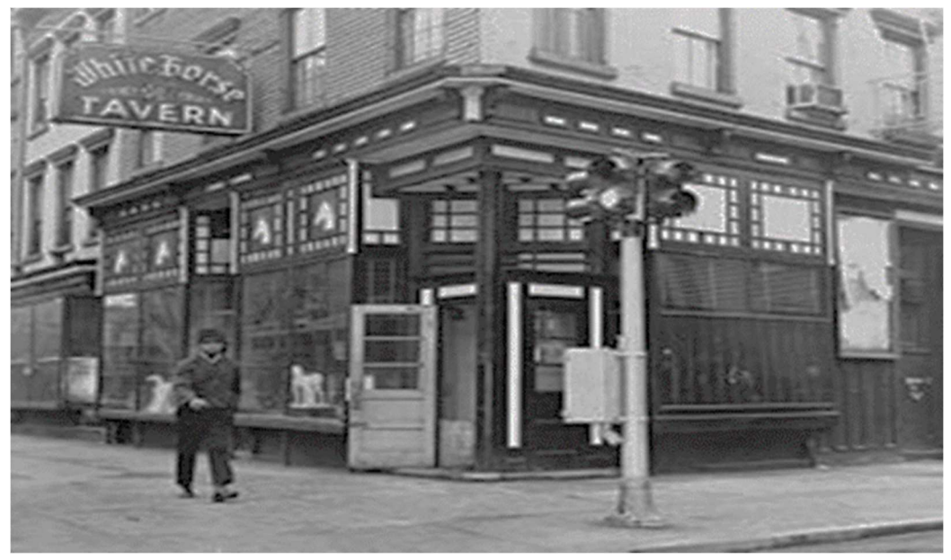
White Horse Tavern in 1961, New York, NY (Est. 1880)

Although some of its earlier functions were eliminated, the American tavern continued to thrive as a social gathering place for creative and like-minded individuals, and still does today. The White Horse Tavern, for example, which became later known for its famous literary and artistic patrons, continues to remain the second oldest pub in New York City.<sup>73</sup> However, one of alcohol's biggest breaking points, began near the 1890s.