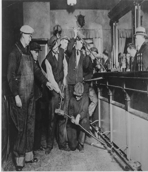
Prohibition agents destroying a bar