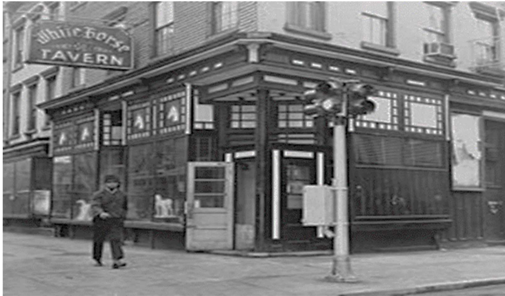
White Horse Tavern in 1961, New York, NY (Est. 1880)

Although some of its earlier functions were eliminated, the American tavern continued to thrive as a social gathering place for creative and like-minded individuals, and still does today. The White Horse Tavern, for example, which became later known for its famous literary and artistic patrons, continues to remain the second oldest pub in New York City. 73 However, one of alcohol's biggest breaking points, began near the 1890s.