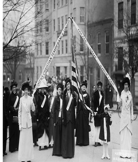
Women's Temperance Movement