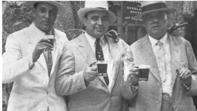
Pictured in middle: Al Capone (1899–1947)

Arguably, Prohibition can be described as a failure. 79 When Prohibition took effect, bootlegging and private distilling operations started occurring. Private, unlicensed barrooms—nicknamed “speakeasies” for how low you had to speak the password to gain entry so as not to be overheard by law enforcement—also became venues for alcohol consumers. While they did cater to female patrons, jazz musicians, and ballroom dancing, they also became the subjects of organized crime from syndicate figures like Al Capone. 80