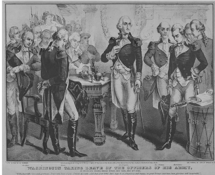
Washington Taking Leave of his Officers, Francis's Tavern; Broad St., NY (Dec. 4, 1783).