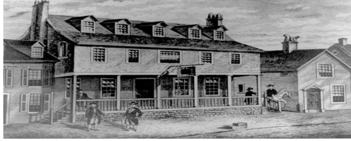
Tun Tavern; Philadelphia, PA (Est. 1686–1781)