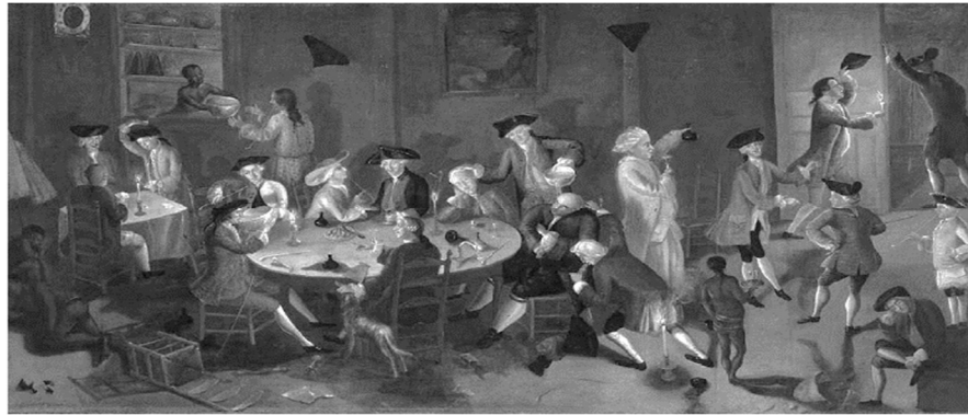
John Greenwood, Sea Captains Carousing in Surina (1755)