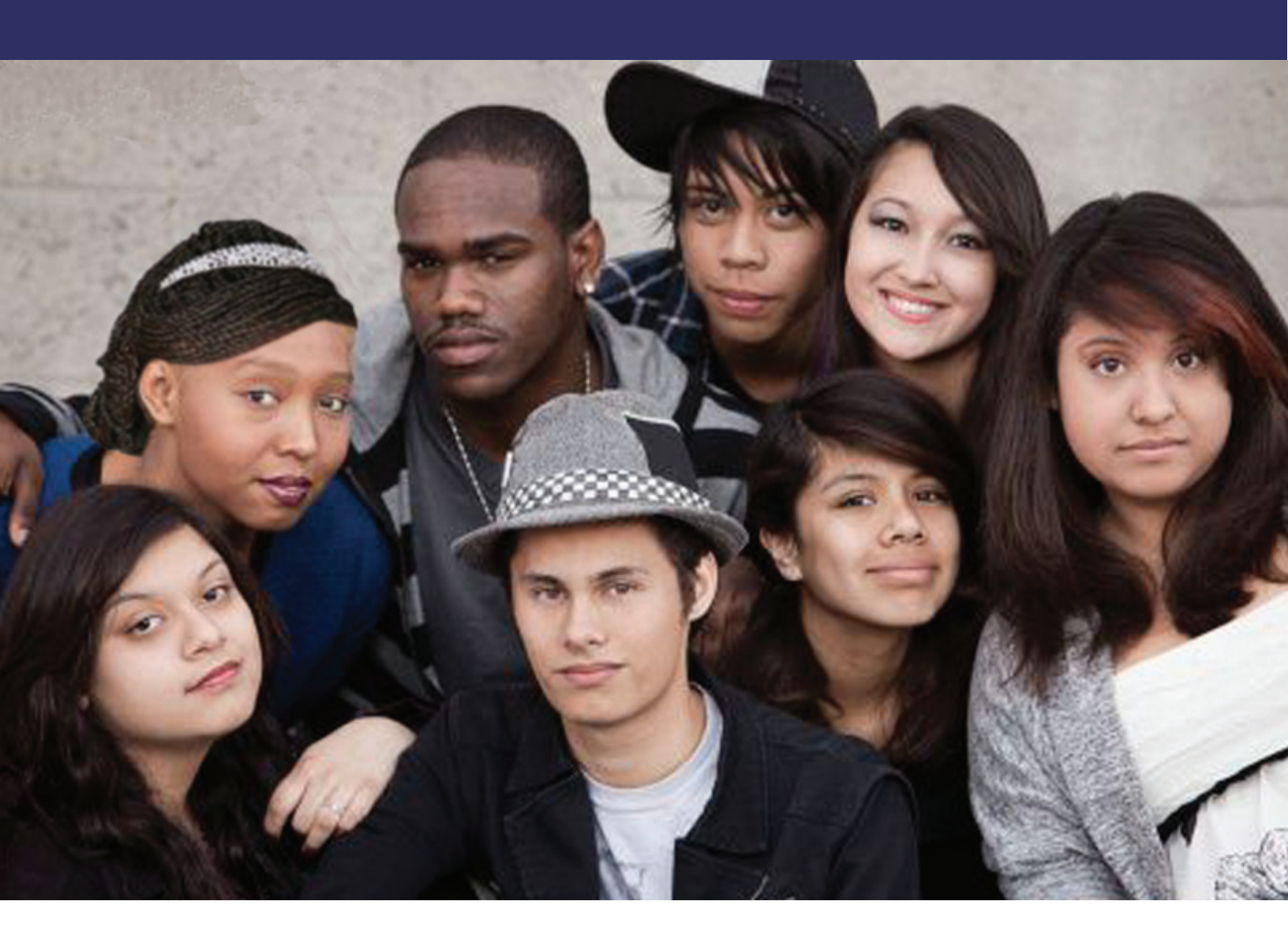
An Overview Report