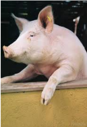
Mbaam or Mbaam-xuux