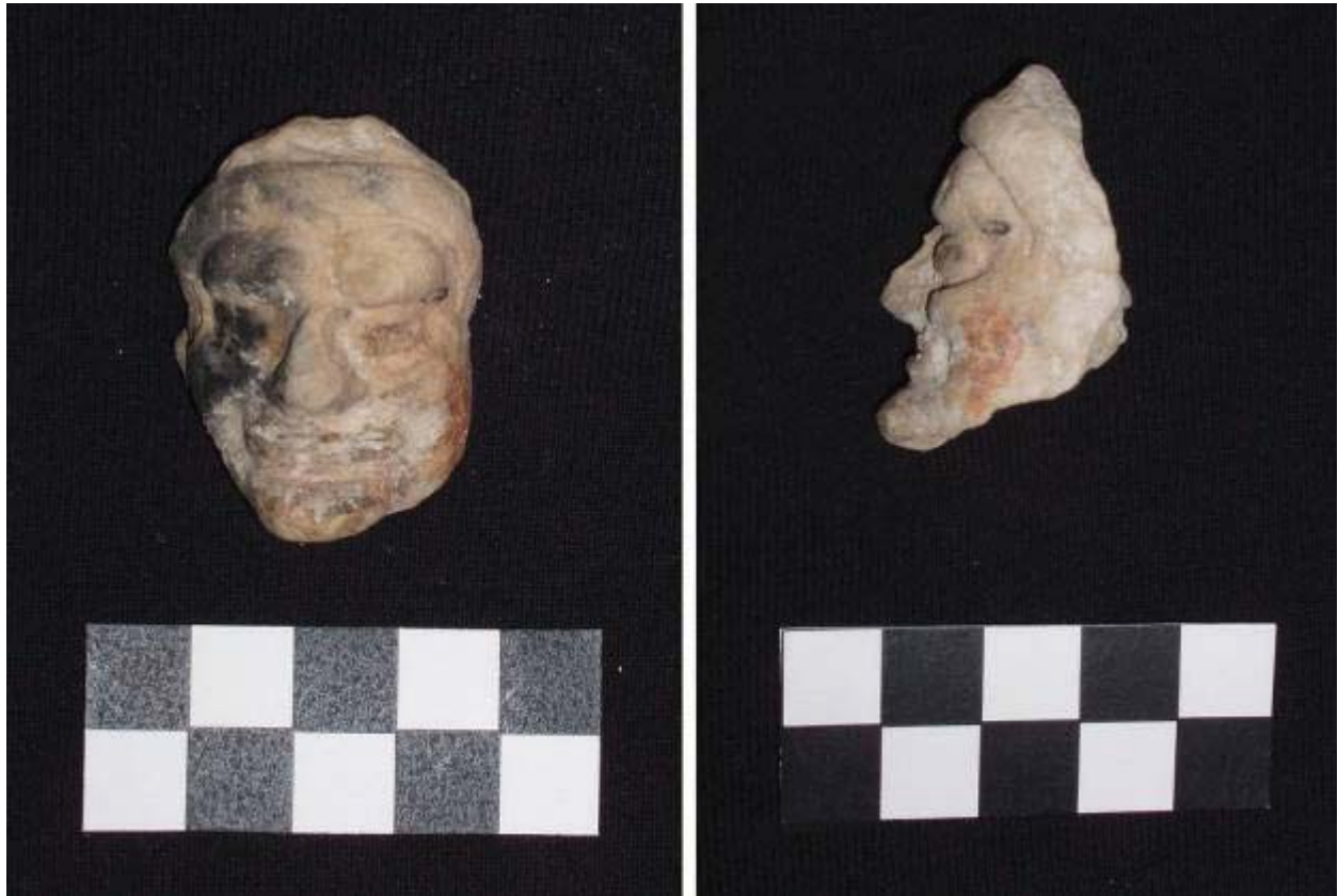
Figure 4. Figurine fragment from Structure 2F, perhaps of God N.

temple (God N)? It is attached to Str. 2G, which on closer inspection might turn out to be an artificial pool (it is quite steep on all sides). What is the significance of the ballcourt being attached at the front of the largest temple (Str. 2A)? Were the ballcourt and temple a stage for re-enacting creation rites, since ballcourts play a large role in origin myths (Schele and Miller 1986:243-245)? Its proximity to the acropolis might indicate its association with the ruling family. Further, its location on the largest and most accessible plaza indicates large audiences. Plaza 3 temples might represent a necropolis, perhaps for founding and royal families; the large plaza size suggests that public ceremonies took place, whatever their purpose.