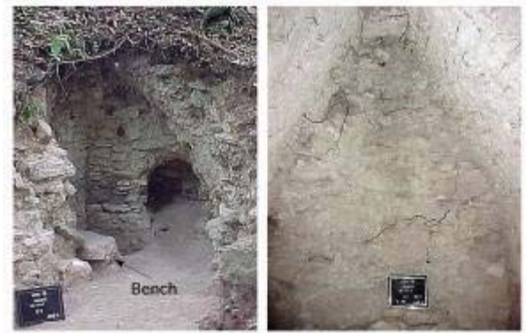
Figure 2. Acropolis architectural features.

fragments with traces of red paint. The LT on at the base of Str. 1A on Plaza 1, LT 17, exposed construction styles more similar to LTs at the temples (boulder core fill, faced stone façade, and no obvious plaster floors), as well as a speleothem fragment, (considered sacred to the Maya as portals to the Xibalba).