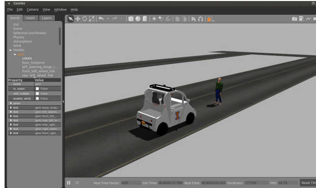
Figure 2: The Gazebo window. The vehicle is stopped before the pedestrian.

You should be able to see two windows opened as shown in Figure 2 and 3.