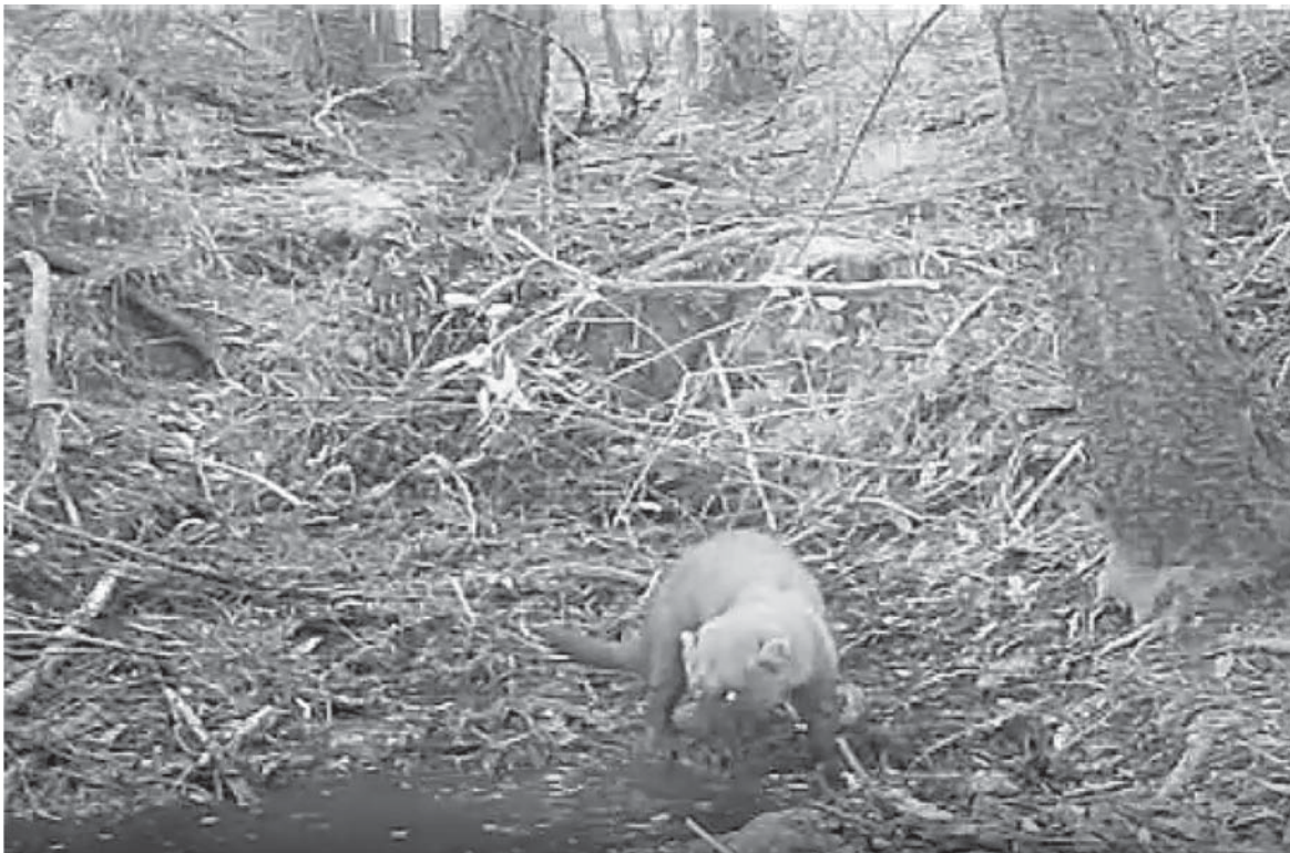
FIGURE 2. —A photo taken from the videos recorded of a fisher investigating a woodland pool of water at 38^{\circ} 43' 33.06'' N, 122^{\circ} 41' 51.90'' W. This location is in Lake County, California, approximately 1 km north of the Sonoma County border.

Grinnell et al. (1937) included anecdotal reports to suggest that fishers extended as far south as Marin County, but did not have direct evidence and these reports could