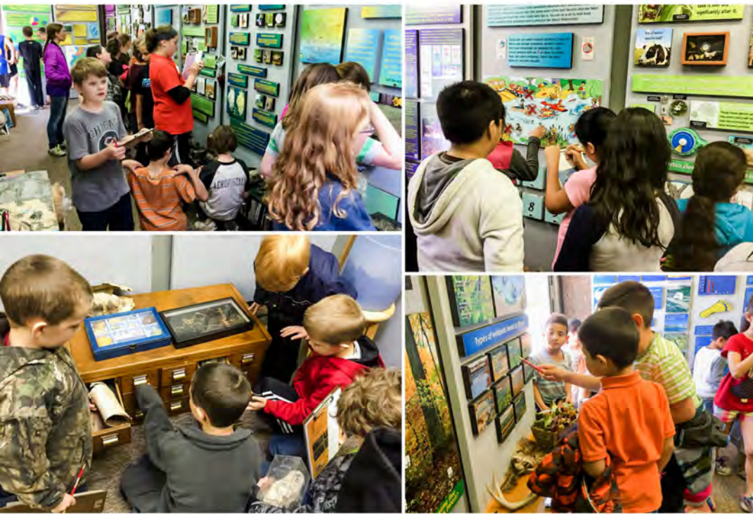
During school programs, students take a scavenger quiz based on grade level. The quizzes are designed to align with science standards and to engage the students while focusing their attention.