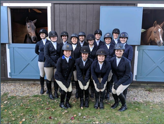
English Show team at SMWC October 18-20