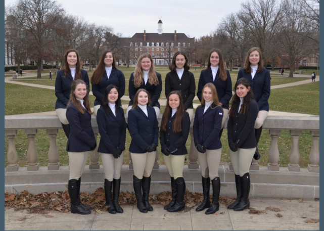
English Show team photos on the Quad