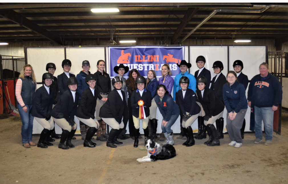
Above: Both English and Western members at our Gordyville Show (November 16 and 17th)

The 2019/20 school year has been a great year for the Illini Equestrians. Our English and Western shows had many exciting shows and accomplishments during our show seasons. Along with that, the club had so many fun opportunities this year and we were able to learn more about horses while participating in some excellent events that allowed us an outlet outside of our busy school lives! Overall, 2019-2020 was yet another great year for Illini Equestrians.