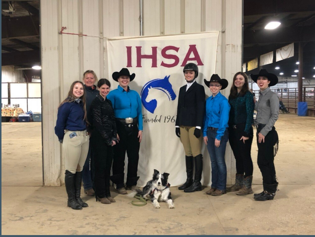
Western Show team at Gordyville November 16-17