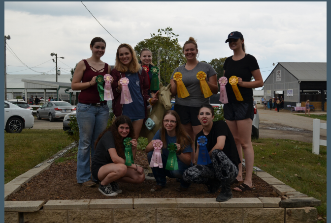
Western showing off their ribbons in Newcastle Spetmber 28-29

What a great show season both of our teams had this year! English and Western Show teams sure kept busy during both Fall and Spring semester and competed against other schools in our region. This year was notable as we had a combined English and Western Show hosted at Gordyville, so both teams were able to come together and support one another which was such a fun experience. All in all, both teams had very successful seasons.