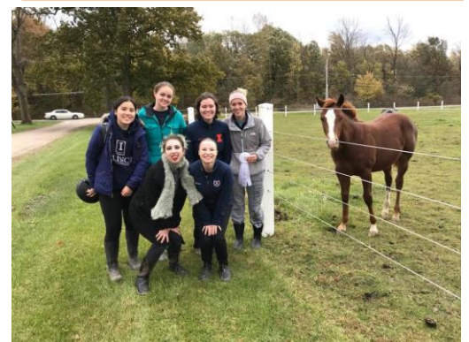
The last Western show of first semester was in Newcastle on October 27 th and 28 th . Congratulations to all riders on a great first semester of showing!