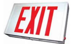
TEMPORARY MEMBRANE STRUCTURES AND TENTS