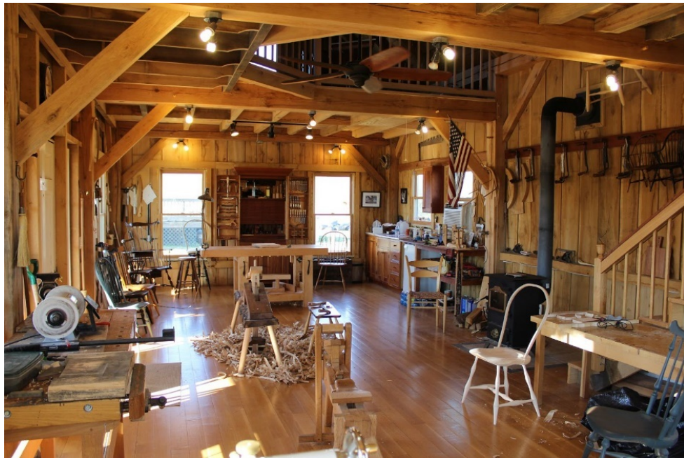
Construction workshop to train carpenters, etc. (this should be beautiful as well so some form of art made of out wood like statue or furniture that is like art.