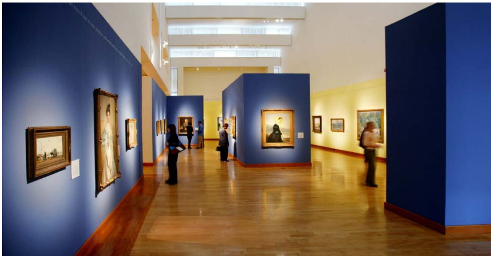
Gallery: another color other than blue but this type of layout is good.