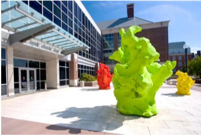
Like the colors, maybe a less abstract shape