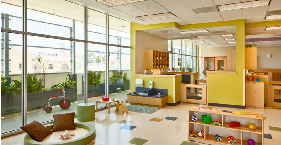
Child care center – lots of light, greenery, colorful