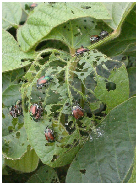
Fig. 2. Japanese beetles ( Popillia japonica ) consuming soybean leaves. The Japanese beetle is a broadly polyphagous species introduced into the United States in 1916 that is now expanding its range throughout the Midwest (27). Japanese beetles are attracted to poorly defended, high-sugar soybean leaves that develop under elevated CO 2 . Future increases in CO 2 and temperature may further the success of such destructive invasive species (28)

A rise in CO 2 generally increases the carbon-to-nitrogen ratio of plant tissues (17, 18), reducing the nutritional quality for protein-limited insects (19). Insects may accelerate their food intake to compensate for reduced leaf nitrogen content (19–21), although this is not always the case (22, 23). By exposing a soybean crop to elevated CO 2 under