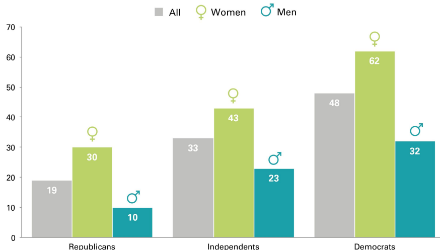
Feminist Identification Among Millennials by Gender and Party Affiliation Percent who say “feminist” label describes them somewhat/very well

Source: Public Religion Research Institute, Millennials, Sexuality, and Reproductive Health Survey, March 2015.